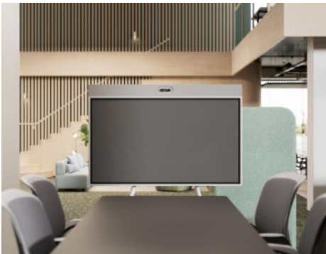
Cart with camera above