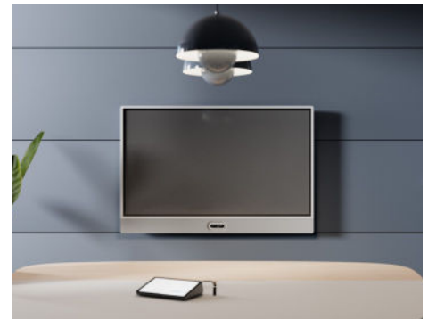
Wall mount with camera below

Designed for flexibility, Rally Board 65 is made for the way you meet. It works seamlessly with leading platforms like Microsoft Teams, Zoom, and Google Meet* in Android, PC, or BYOD mode, so you can easily adapt Rally Board 65 for current and future needs. Plus, it provides multiple mounting options**, so you can add it to any open space or meeting room. It's made to deploy with the camera above or below the screen to allow all participants to maintain natural eye contact in all spaces.