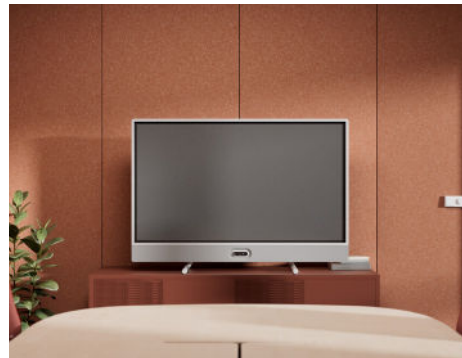
Table stand with camera below