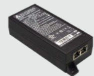
Poly PoE++ 65W Adapter For customers without PoE++ available in meeting rooms

Smart center-of-table 360° view companion camera that works seamlessly with Poly Studio X32 automatically deliver the best angle of meeting participants. (pending availability)